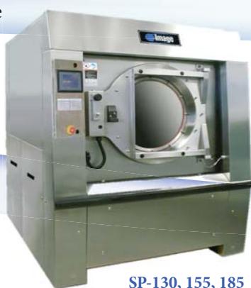
SP-130, 155, 185

Loading and unloading are fast and easy through the oversized door that opens 165 degrees. The door is constructed of stainless steel, supported with a highly durable stainless steel hinge design and located at a convenient height for laundry carts. SP Series Washer Extractors with capacities up to 100 lbs are assembled with a silicone door gasket is designed for long life and seals to the shell every time without leaking. Also, SP Washer Extractors with capacities up to 100 lbs has a powerful, safe and easy to operate electro-mechanical door interlocking system. Washer Extractors with capacities over 100 lbs has a silicone door gasket that is safely pneumatically pressured providing extra sealing strength. Furthermore, SP Washer Extractors with capacities over 100 lbs are equipped with a highly robust, yet easy to operate mechanical-pneumatic door interlocking system.