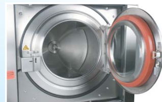
SP-40, 50, 65, 75, 85, 100