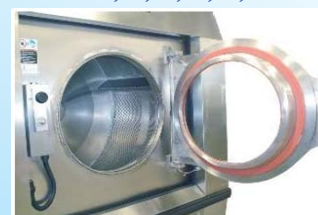
SP-130, 155, 185