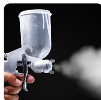
Decomposes volatile organic compounds (VOCs) and other organic compounds