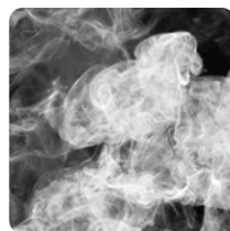
Removes hazardous chemical gases